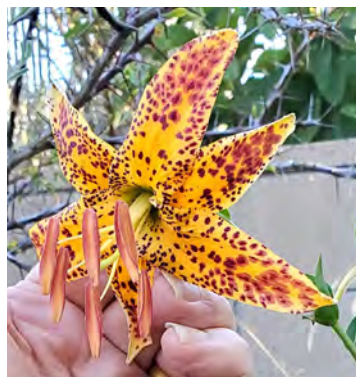
Lilium humboldtii and L. parryi are “Tiger” lilies, orange

Generally, plants from these organs are winter-growing, spring-blooming, and dormant in summer and fall. See also www.pacificbulbsociety.org .