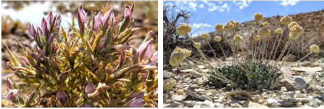
Left: Tecopa birds-beak; right: Tieham's buckwheat

of the Joshua trees ( Yucca brevifolia ). This species is predicted to undergo widespread extirpation in the southernmost part of its range. These factors have underscored the urgency and importance of a regional floristic inventory and compelled me to dive into this research.