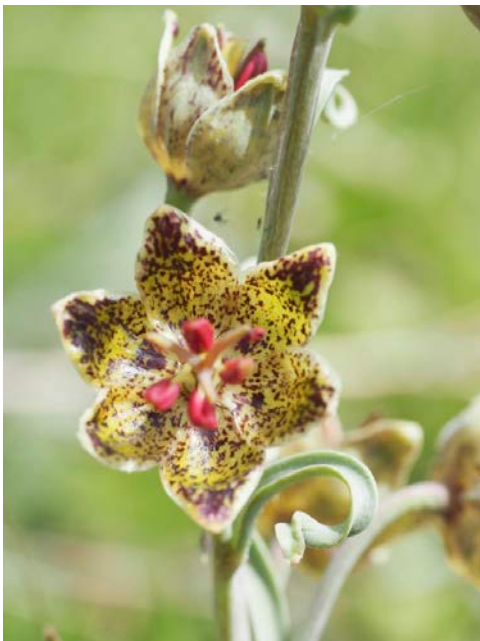
Pinewoods fritillary ( Fritillaria pinetorum ) is ranked by the California Native Plant Society as a 4.3, meaning that it has a limited distribution in California. Coming across it at the edge of Big Meadow in my study site, was such a surprise!