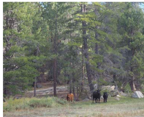
Cattle are present in Horse Meadow (pictured) and in other meadows throughout the Sierra Nevada throughout the summer months.

I was ecstatic to get out in the field this summer. It was such a joy to spend time in green meadows, next to lush streams, and among the Jeffrey pines. While