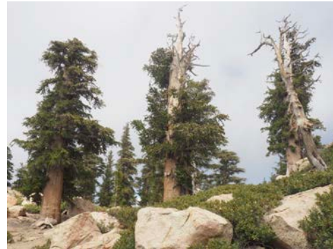
Foxtail pines ( Pinus balfouriana ) are endemic to California, found only in the Sierra Nevada and Klamath mountains. Their southernmost population is found in my study site, at Siretta Peak!

As a M.S. student at CalBG, I am doing a floristic inventory of the Manter and Salmon Creek watersheds, located in the southern Sierra Nevada,