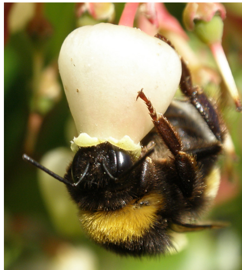
Photo. Buzz pollination of madrone ( Arbutus unedo )

Pollination is the transfer of pollen from a male anther to a female stigma. It enables fertilization among flowers on the same plant (self-pollination), and when pollen is transferred to another plant with compatible flowers (cross-pollination). Most pollinators are insects, especially bees, but birds, bats, humans, wind, and water also transfer pollen.