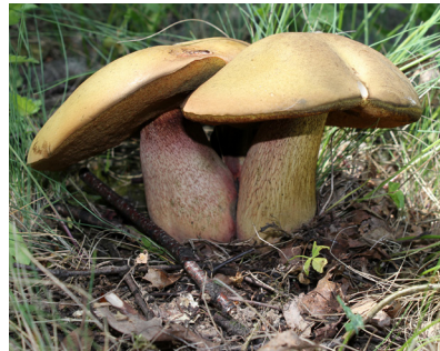
Many mushrooms that grow from the soil are the sexual, spore-producing bodies of ectomycorrhizae, like this Boletus luridus .

The hyphae of mycorrhizal fungi spread from plant roots out through the soil, mainly absorbing phosphorous, nitrogen, and water. These are transferred to the plant in exchange for carbohydrates. This exchange defines the two main types of mycorrhizal fungi. Ectomycorrhizae form a net of absorptive hyphae within the root but outside (ecto-) of the cortical cells. The transfer of nutrients and water occurs around the root cells, not within them. Ectomycorrhizal hyphae also form a mantle around the outside of roots and are present in about 5 percent of plant species. Endomycorrhizae form absorptive structures called arbuscules within (endo-) the root cells. These balloon-like arbuscules function like the haustoria of rust fungi (see Oak Notes, September 2017). Endomycorrhizae are associated with 80–90 percent of plants.