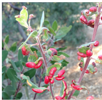
Figure 1. New galls formed by plant-parasitic aphids on leaves of a manzanita.

Bright red galls recently appeared on leaves of several manzanita plants at RSA (Fig. 1). They were created by aphids, small soft-bodied insects that suck sap from the plants' phloem. The galls distort the leaves, but seldom cause severe plant growth problems.