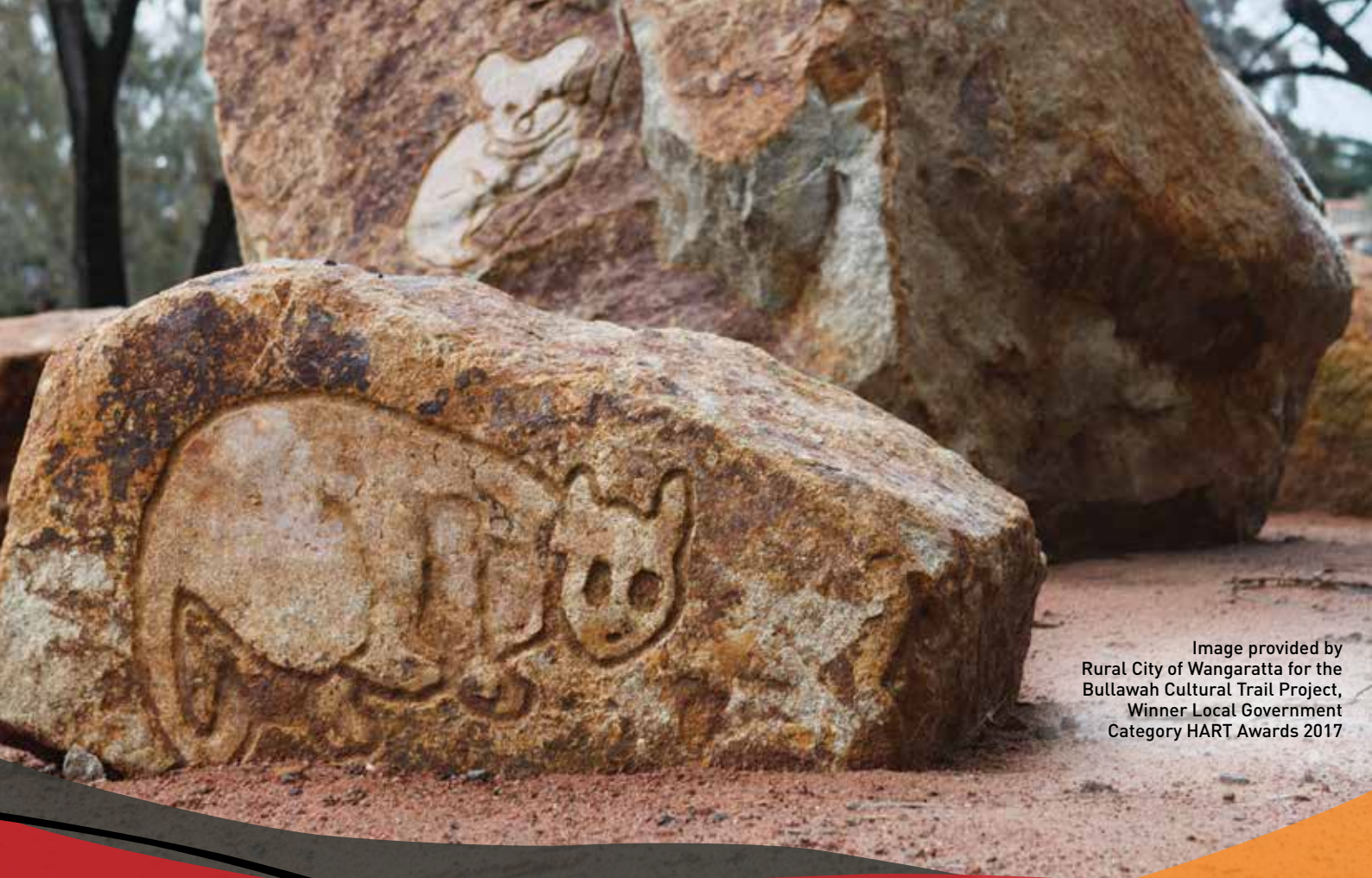
for the Bullawah Cultural Trail Project, Winner Local Government Category HART Awards 2017