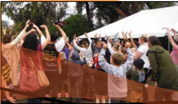
Womin Djeka Balnarring Ngargee