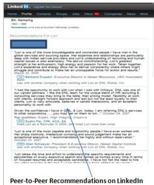
Figure One: Social Recognition on LinkedIn

Certainly, the on-line world is rife with peer-to-peer recognition. Most social media, including blogs, discussion boards, magazines and news outlets invite ratings, “likes” and other feedback from users. The most popular social networking sites encourage recognition also (Figures One and Two). A typical Facebook or LinkedIn page provides numerous examples. Popular social media sites have also morphed to become social referral and recruiting tools used to make introductions, recruit members, and even for match-making. They have also become tools for recruiters, both to promote positions and connect with prospective employees. Many recruiters also use the sites to “investigate” and screen applicants based on the appropriateness