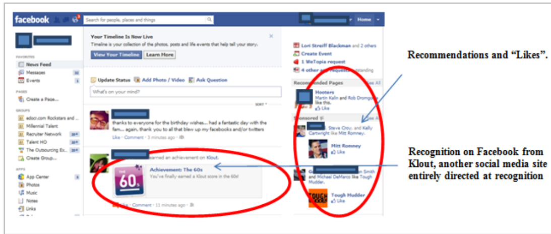
Figure Two: Social Recognition on Facebook

As Facebook passes the billion subscriber mark, social media is already the number one activity of the web (Socialnomics.net, 2011). According to Nielsen in 2009, “In the U.S. alone, total minutes spent on social networking sites increased 83 percent year-over-year. Incredibly, total daily minutes spent on Facebook have increased from 1.7 billion minutes in April 2008 to 10.5 billion in January 2012 – and that figure does not include access on mobile devices.” 4