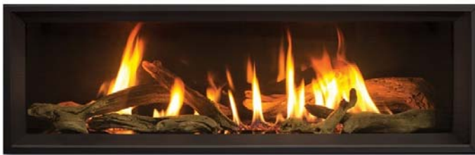
Black Porcelain Liner – Ultra High Definition Log Set