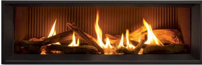
Fluted Liner – Ultra High Definition Log Set