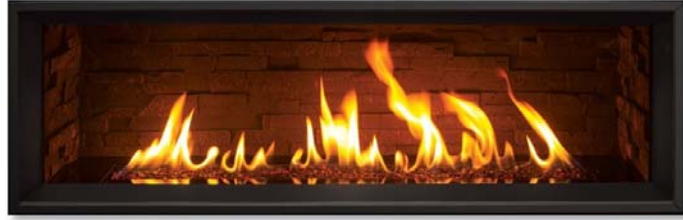
Ledgestone Liner – Bezel Base