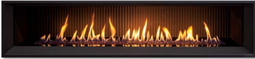
Fluted Liner - Bezel Base