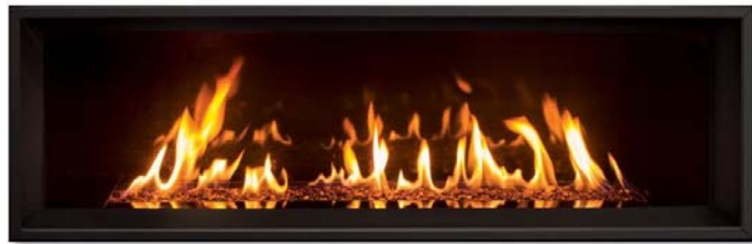
Black Porcelain Liner – Bezel Base