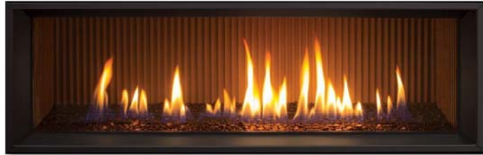
Fluted Liner – Full Glass Tray