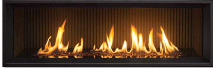
Fluted Liner – Bezel Base