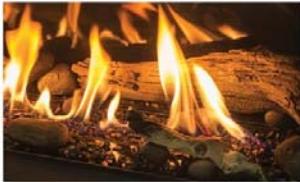
Rock & Log Set