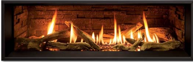
LedgeStone Liner – Ultra High Definition Log Set