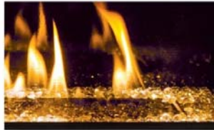
Halogen Light Kit