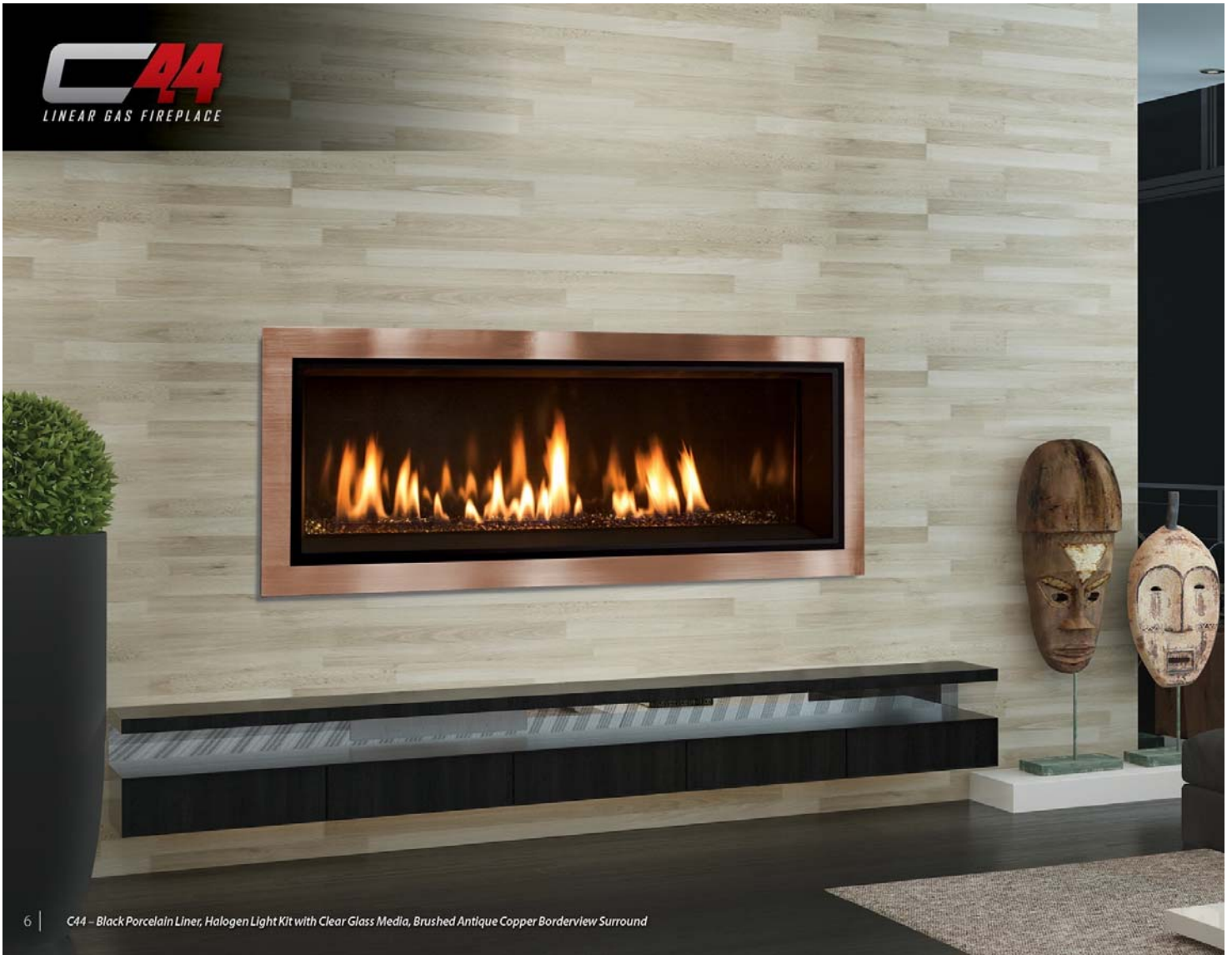
6 | C44 - Black Porcelain Liner, Halogen Light Kit with Clear Glass Media, Brushed Antique Copper Borderview Surround