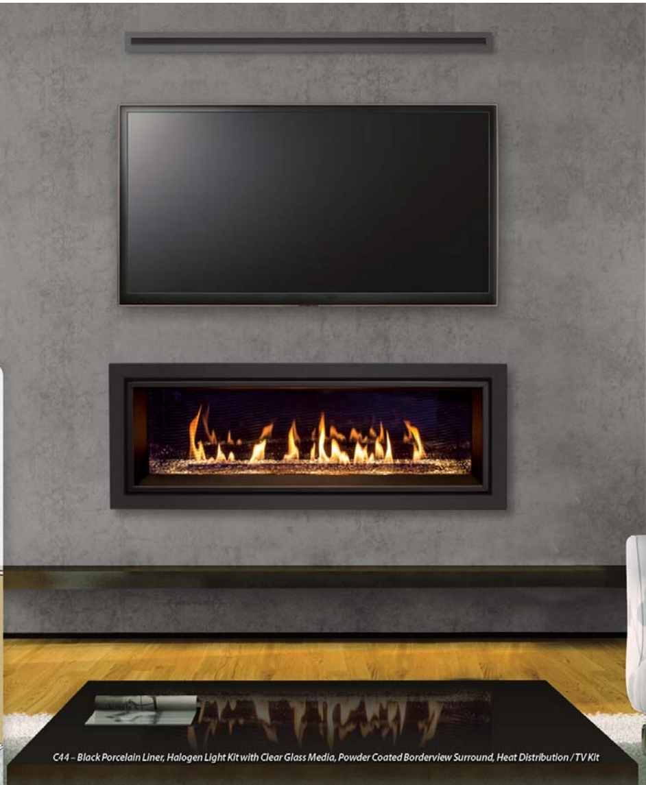
C44 – Black Porcelain Liner, Halogen Light Kit with Clear Glass Media, Powder Coated Borderview Surround, Heat Distribution /TV Kit