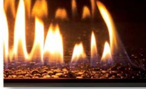
Full Glass Tray

Includes Black Glass Media or Vermiculite Compatible with the C34, C44, and C60