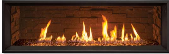
Ledgestone Liner – Full Glass Tray