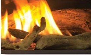
Ultra High Definition Log Set