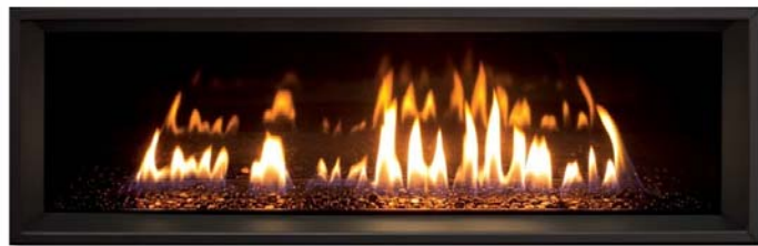
Black Porcelain Liner – Full Glass Tray