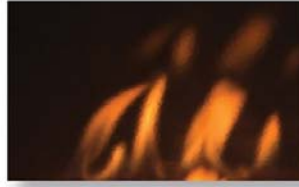
Black Porcelain Liner