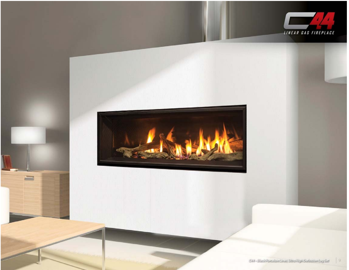
C44 - Black Porcelain Liner, Ultra High Definition Log Set | 9