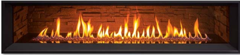
LedgeStone Liner - Bezel Base