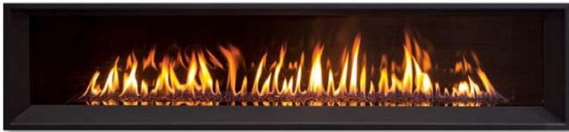
Black Porcelain Liner - Bezel Base