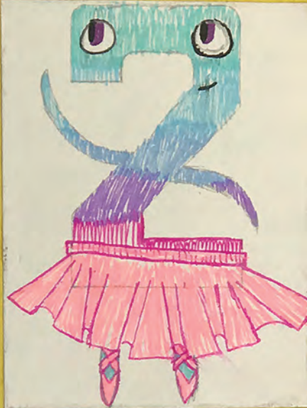
"Two in a Tutu" by Addy Louden