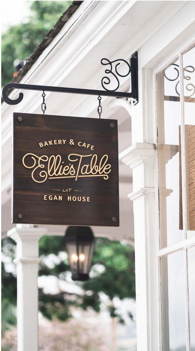
Founded in 2016 our flagship location, Ellie's Table Egan House in San Juan Capistrano