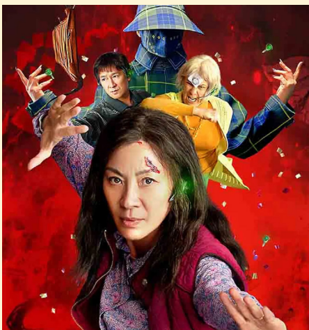
Everything Everywhere All at Once