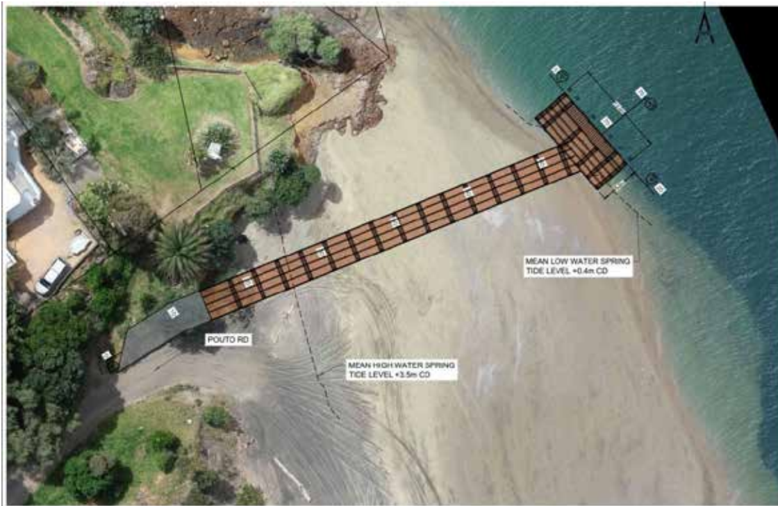
Pouto Wharf under construction. Mid 2023