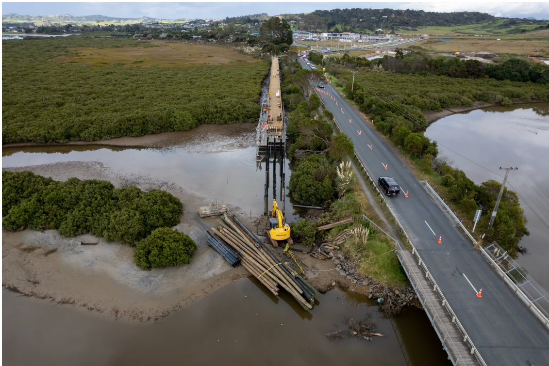
Molesworth Drive Boardwalk under construction. June 2023