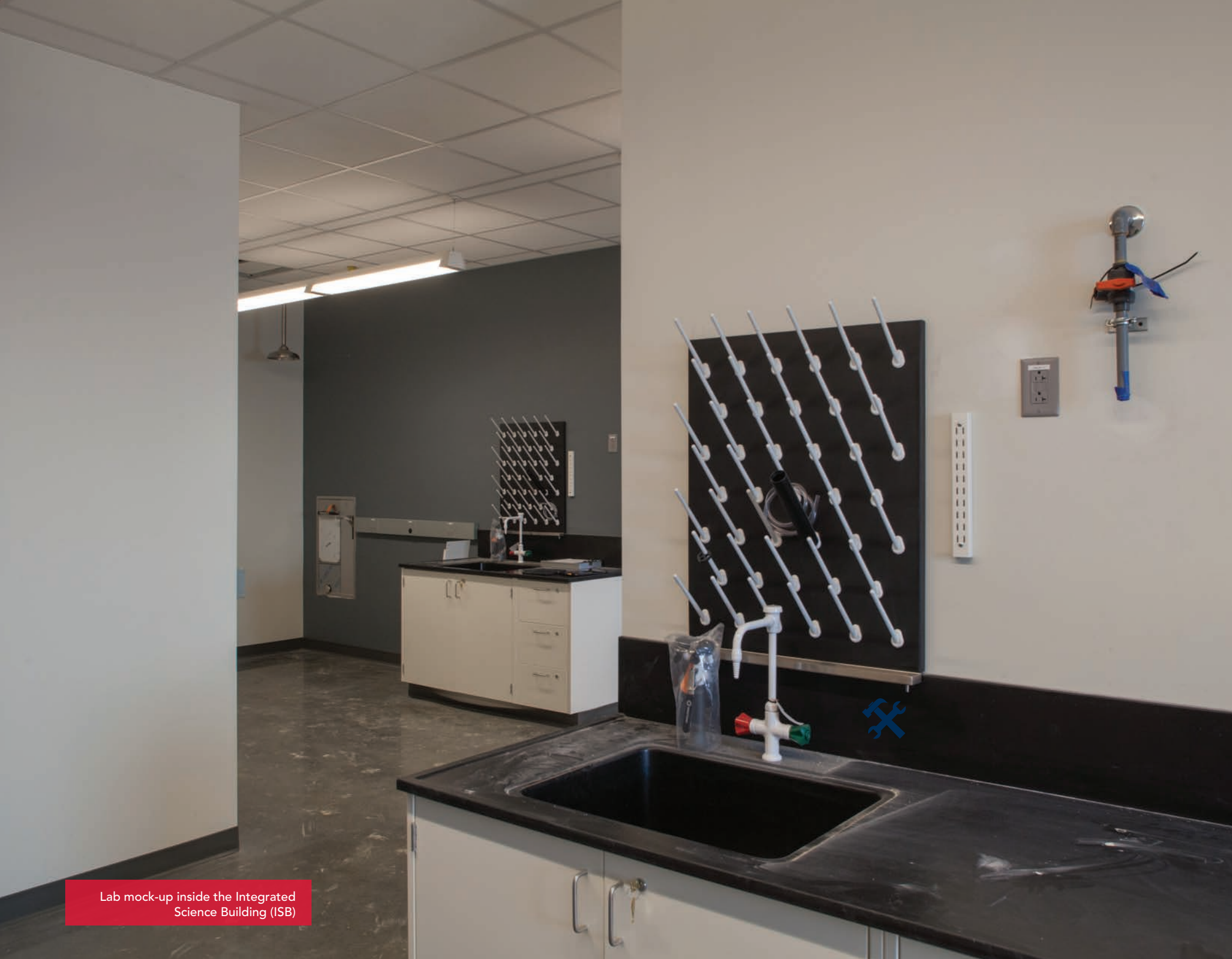
Lab mock-up inside the Integrated Science Building (ISB)