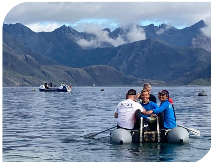
The Rannoch Adventure shore support team has a tender to enable transfers to/from the boat.

A highly recommended expedition giving you a taste of adventure, the ocean rowing life, infused with nature, and the incredible beauty of Scotland.