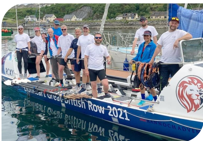
The Great Scottish Odyssey – July 2021 Isle of Skye crew after completion in Mallaig.

The crew were of mixed ages and abilities, all ready to embrace the experience and continued to do so throughout the five days. Everyone had their reasons for undertaking this expedition whether it was for a birthday celebration, a bucket list item, just for the fun and adventure aspect, or to do something different. We all got along with each other and helped where needed. 12 strangers became a team very quickly and you were made to feel welcome.