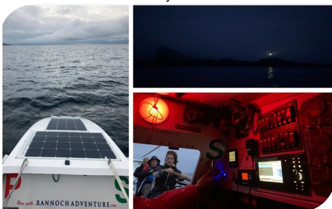
Left: Early morning on the sea. Top right: Neist Point Lighthouse shining through the mist. Bottom right: Red light was needed to retain your night vision and comfort of the rowers at night.

The previous two days eased us into the routine, rotating in shifts and getting used to the life onboard. Now it was time to put it to the ultimate test with the big 36 hour day and night row from the Isle of Raasay to the east of Skye, passing the Old Man of Storr, rounding the top of Skye to then row through the night finishing in the small but picturesque village of Elgol on the South West coast of Skye.