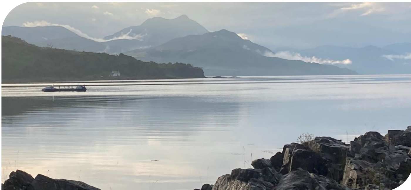
ROXY anchored at Duisdealnor.