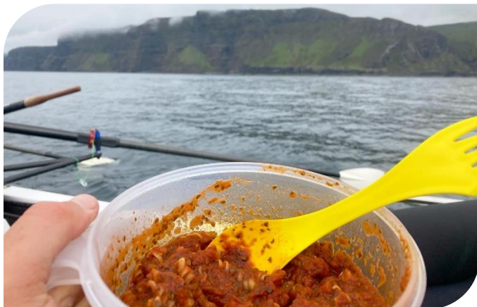
Above: Spicy Pasta Arrabiata by Summit to Eat was popular amongst the rowers. The meals are easily made by just adding hot (or sometimes cold) water.

Food & Drink: We had plenty of food on board the boat including some snacks. De-hydrated meals were the main staple and the majority of these were actually very good. It's fun to experiment with all the flavours, trying it hot or cold, or by adding a condiment.