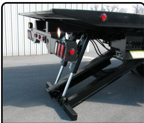
• Hydraulic Stabilizer Bar with Pintel Hitch