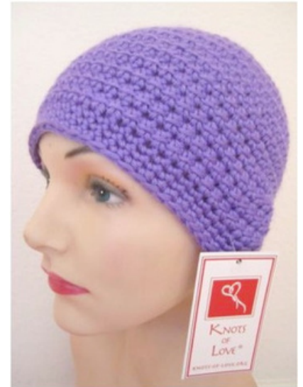
Simple chemo cap using linked double crochet stitch.

Fasten off. Secure yarn ends invisibly and cap will be reversible with each side showing a different stitch pattern. Add flower, bow or button if desired.