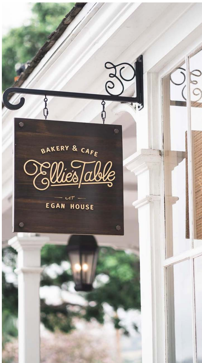
Founded in 2016 our flagship location, Ellie's Table Egan House in San Juan Capistrano